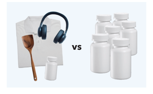
Inventory Specialization Wellevate focuses only on natural health products, making vitamins and supplements our top priority.