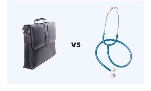
Powered by Practitioners Wellevate is powered by Emerson Ecologics, a supplement distributor that has been serving practitioners for 40 years.